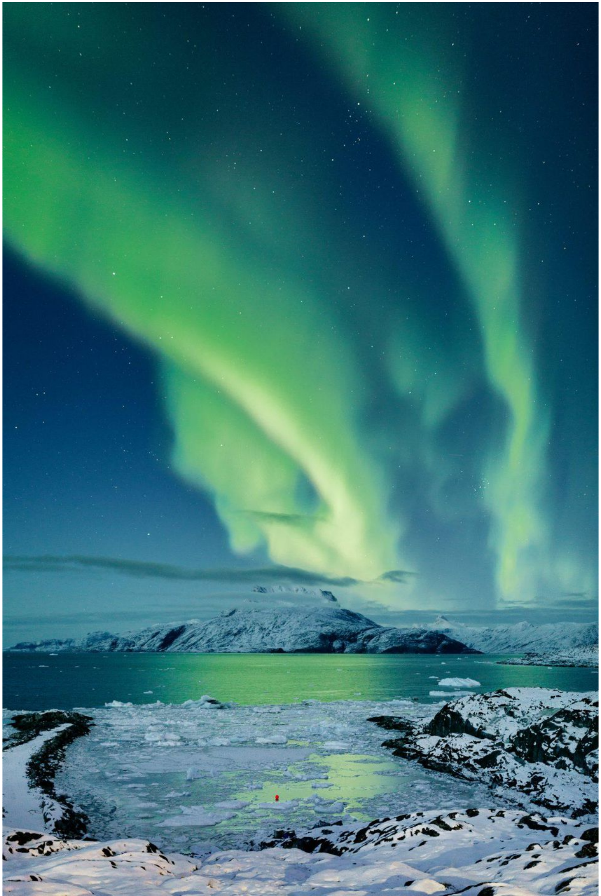
Northern lights over the mountain Sermitsiaq in Nuuk