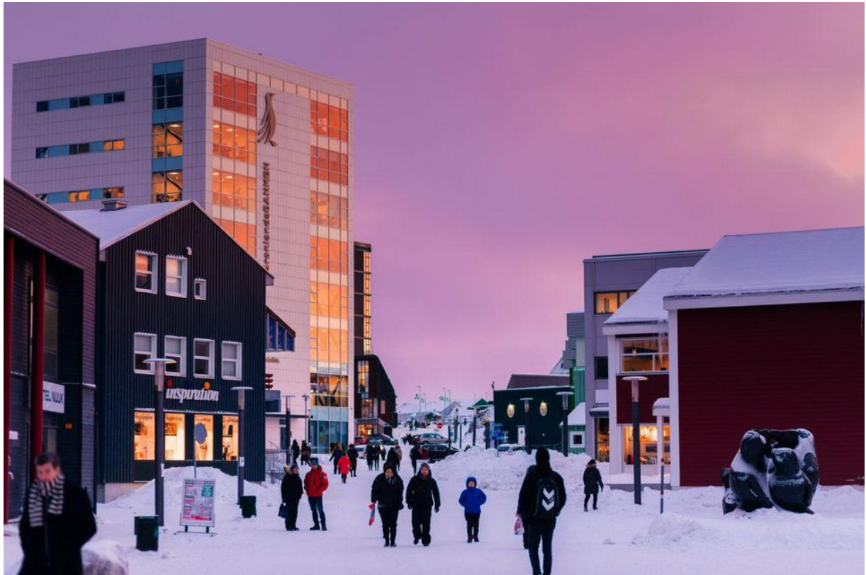
The main shopping street of Nuuk