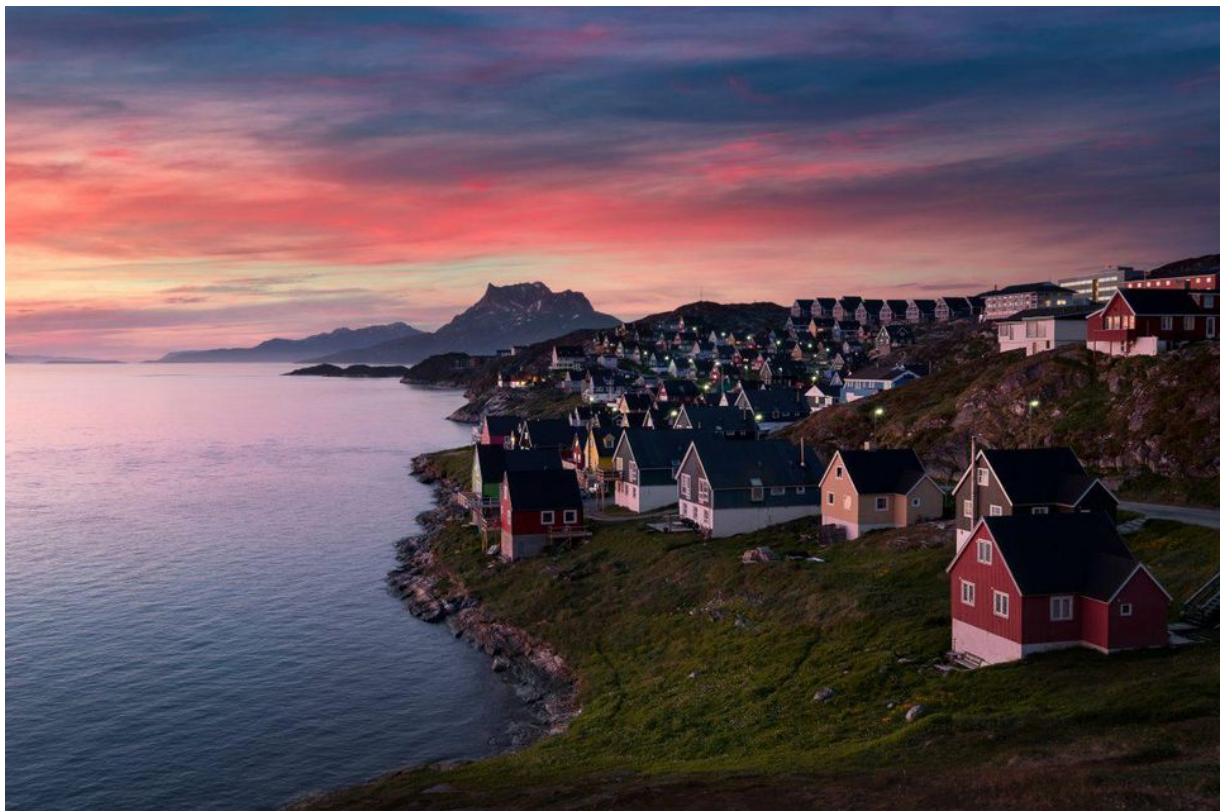
Pink sky, colourful Nuuk ELIA LOCARDI - VISIT GREENLAND

With the vast majority of Greenland covered by an ice sheet, this island nation is often defined by its rugged beauty of dramatic fjords, remote settlements, massive icebergs, soaring mountains, and desolate expanses. Few roads course through this vast, almost lunar, landscape, making travel via chopper, boat or kayak a necessity. Yet, its capital city, Nuuk, successfully blends a scenic location at the mouth of a stunning fjord and vistas saturated with the ever-changing colors of land, sky and sea, with a sophisticated cosmopolitan sensibility, whether its contemporary art galleries, minimalist architecture, stylish fashion, or an enviable, modern, locavore-focused gastronomy scene.