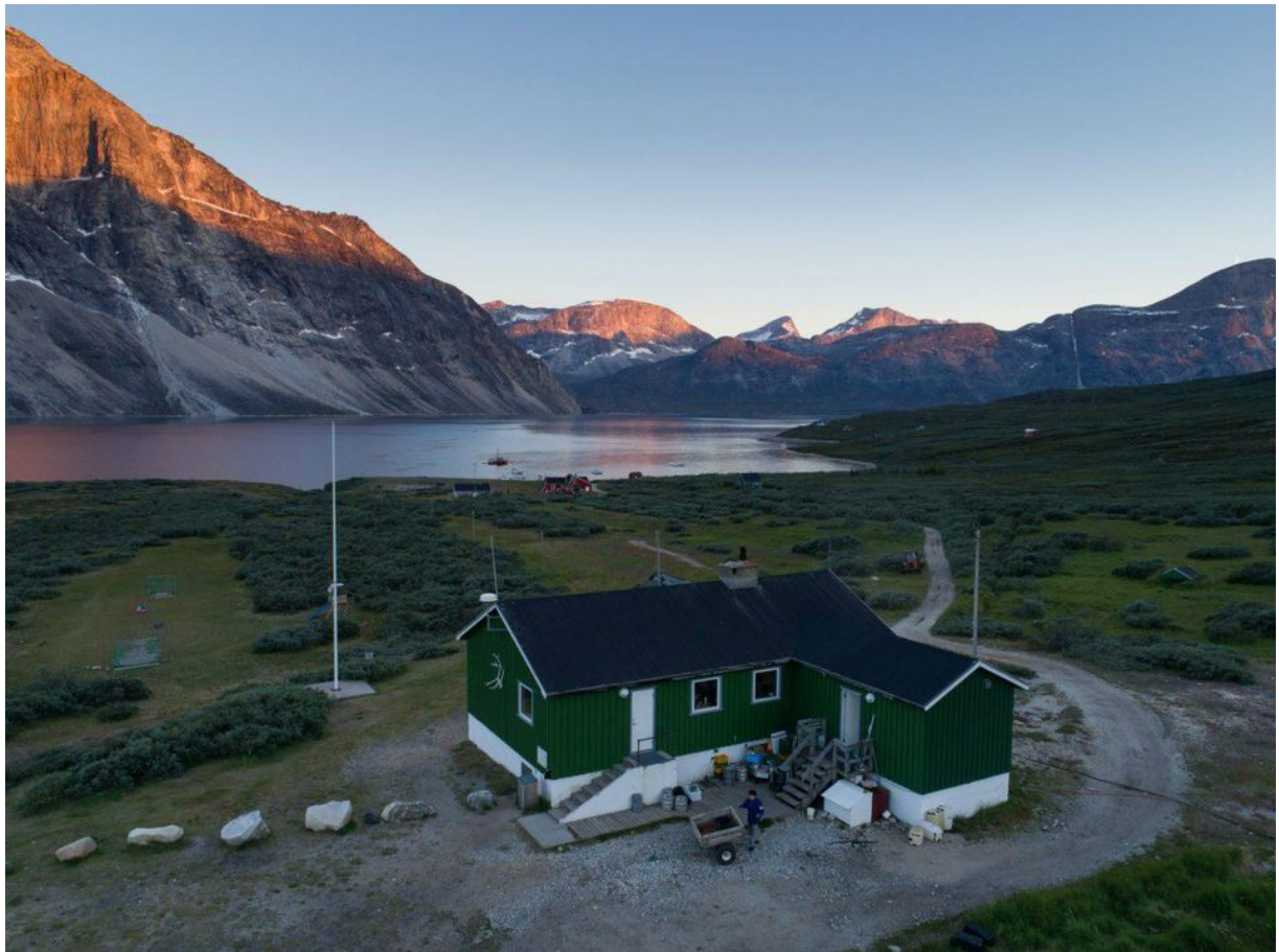
Qooqut Nuan