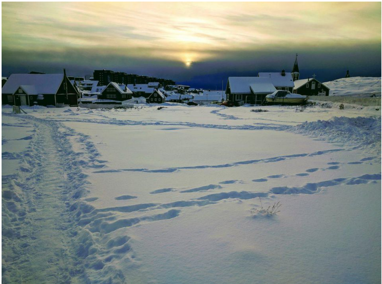
Nuuk Winter JESPER ØRAKER

Yet, many savvy travelers have not placed Greenland on their list, either because they deem it too difficult to venture to, not worth the time and effort, or believe the signature sights and activities only revolve around the northern lights or dog sledding. Now, a new, Nuuk-based company, Greenland Escape , is offering myriad tours and services for the discriminating traveler that open a window into Greenland's plethora of treasures that will touch the senses in unforgettable ways. For example, photography enthusiasts can opt for an all-day excursion that includes an art walk -- Nuuk is sprinkled with outdoor sculptures and murals -- along with a hike around a lake to explore shooting images of local flora, plus a boat tour of the Godthab Fjord to hopefully spy seals or whales. The luxury or elite traveler tour includes three nights of glamping (luxe camping) deep in a fjord along with a heli-picnic at the top of Nuuk's landmark, Sermitsiaq Mountain; hiking with a private guide who will also act as their chef; kayaking between icebergs; and, at night, relaxing with a shot of whiskey chilled by iceberg-derived ice. I recently interviewed Jesper Oraker, the owner and managing partner of Greenland Escape, who's a Nuuk resident, and who provides a unique perspective, given that he's lived and traveled extensively far beyond Greenland, including Australia, U.S., Sweden, and Denmark (where he was born).