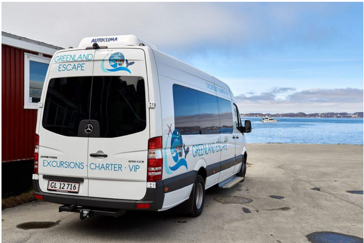
Shuttle VH