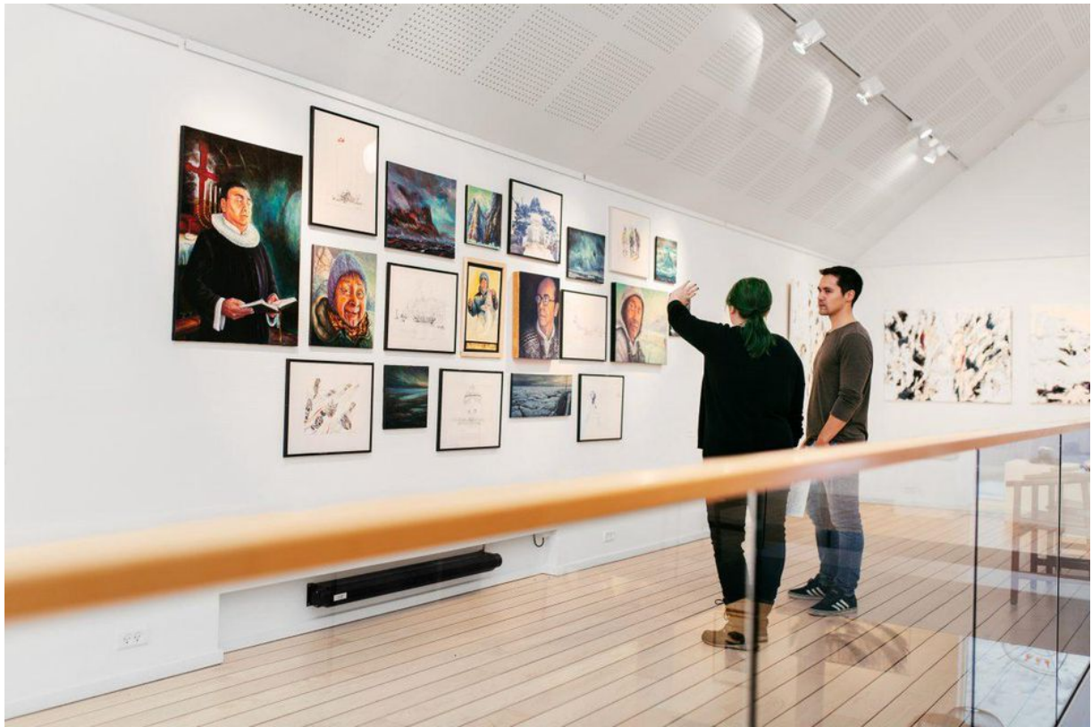
Visitors in the Nuuk Art Museum