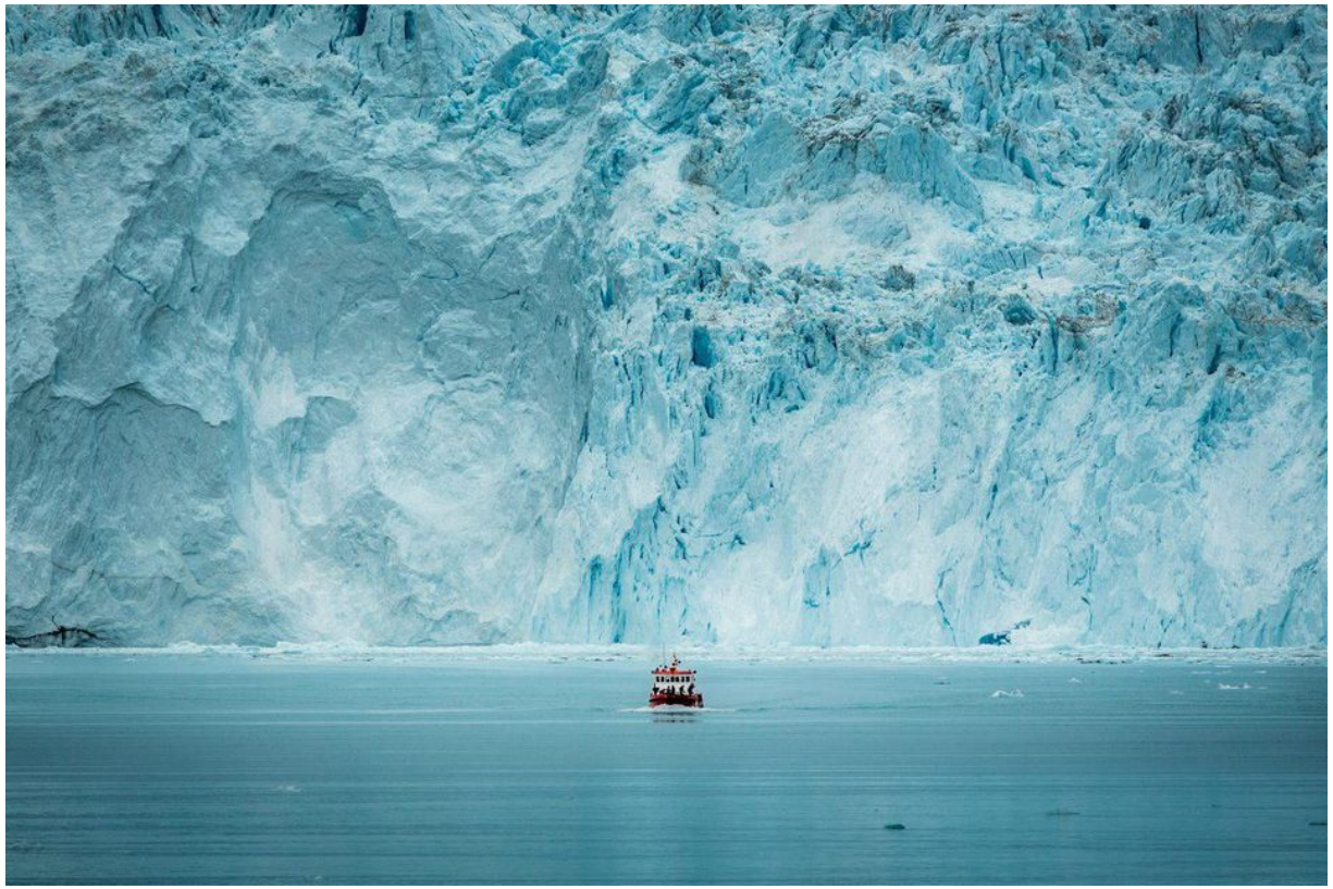
Eqa Glacier Ilulissat