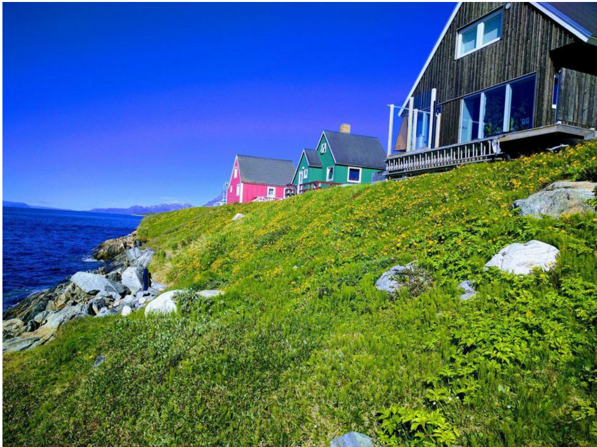
Colourful Nuuk JESPER ØRAKER