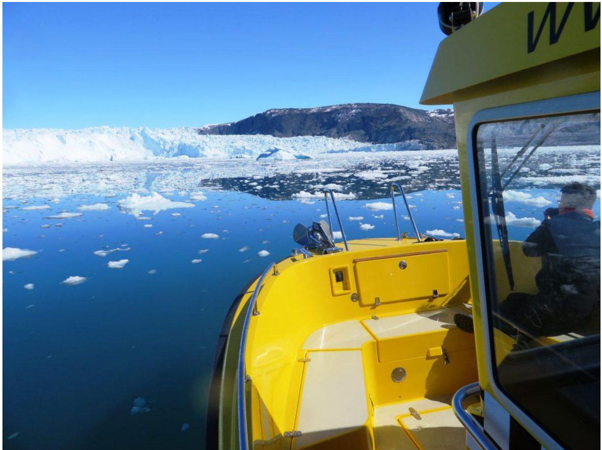
Icefjord NUUK WATER TAXI