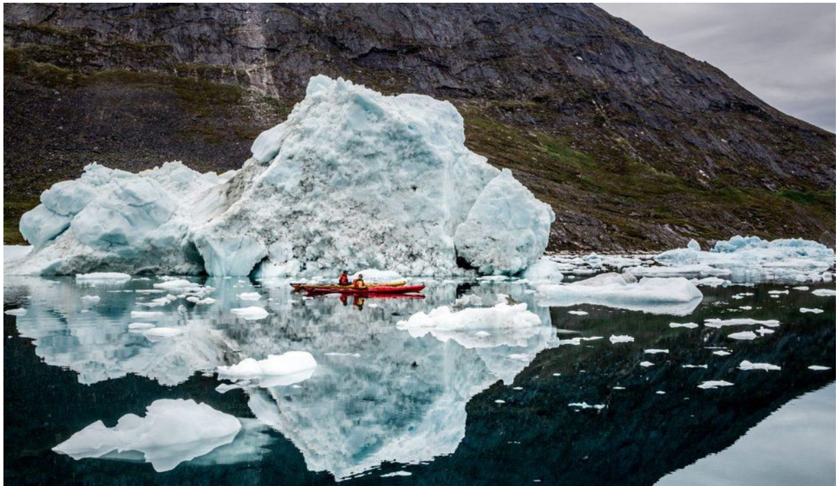
Two kayakers paddle around icebergs in Nuuk Fjord as a daytime adventure while staying at the Arctic Nomad Adventure Camp